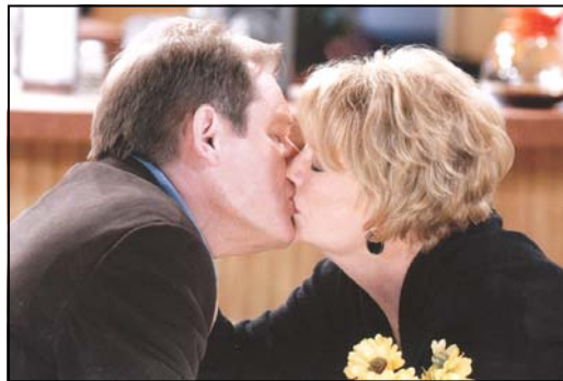
Paris, TX Llanview style (before "Llanview 90210")