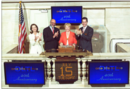
Ringling the bell at the NYSE