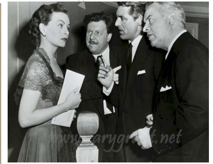
Publicity photos from “People Will Talk” www.carygrant.net