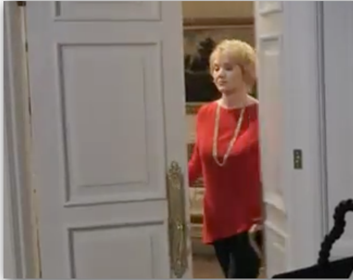
A brand new day of another...Life to Live

What was your family's reaction to the news about the reboot? They were pleased about it. They were happy to get me out of the house!