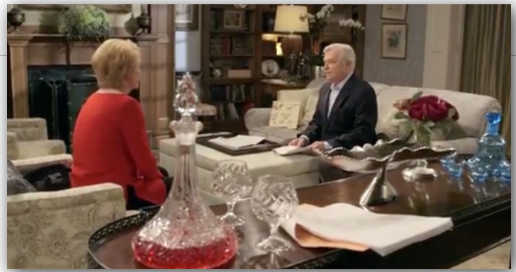
Updated Lord Library

Recently, you were quoted as saying that the scripts are an easier conversation, and that they can move more quickly. Can you elaborate, and what is your perspective around how