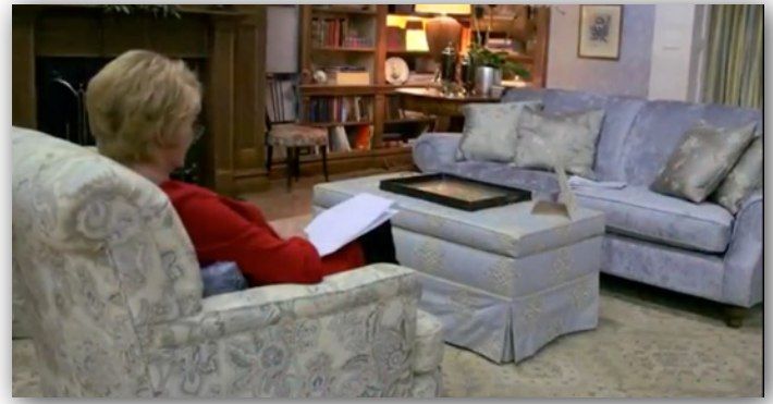
Ready to get the show started!